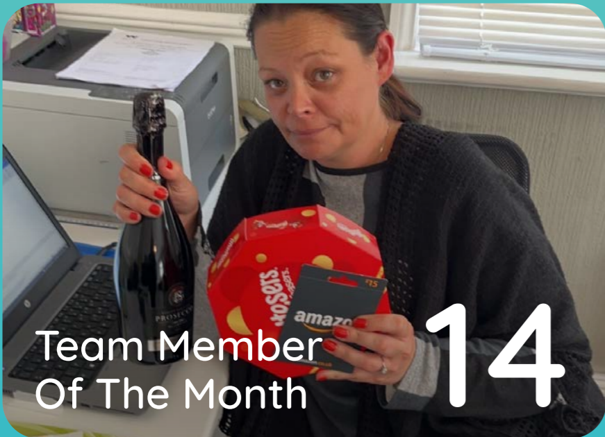
Team Member Of The Month