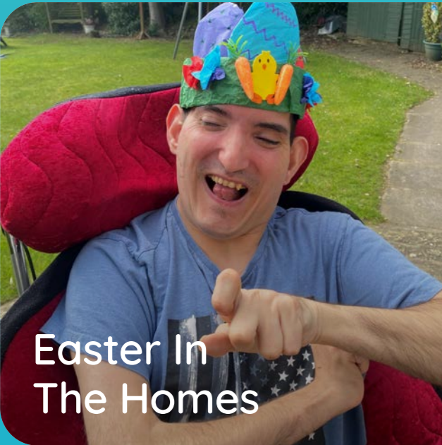
Easter In The Homes