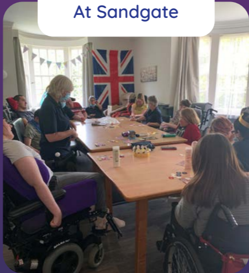
Bingo At Sandgate