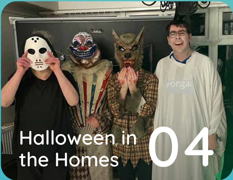
Halloween in the Homes 04