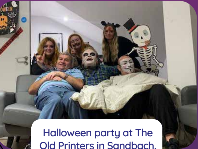
Halloween party at The Old Printers in Sandbach.