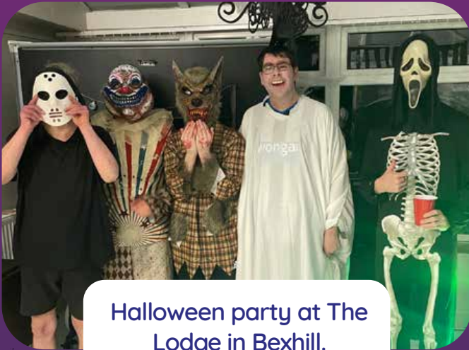
Halloween party at The Lodge in Bexhill.