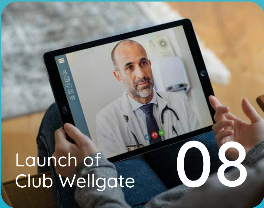
Launch of Club Wellgate 08